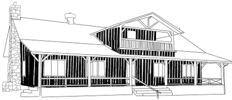
Chief Logan Lodge