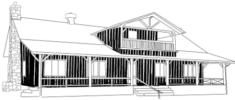
Chief Logan Lodge